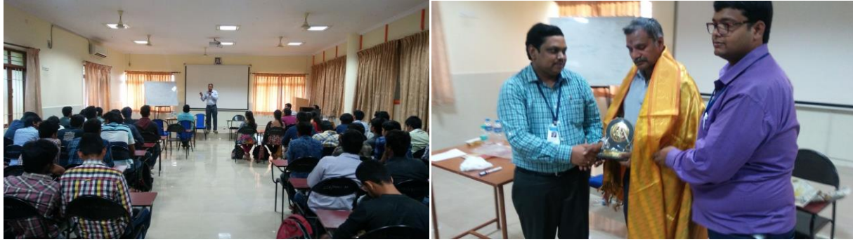
13. One day National Conference on RECENT ADVANCES IN MECHANICAL ENGINEERING(NCRAME-17) on 02.12.2017 organized by Department of Mechanical Engineering sponsored by Siddhartha Academy of General and Technical Education, Vijayawada.